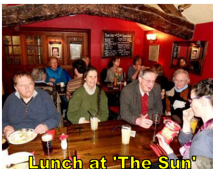
Lunch at 'The Sun'

The 18th century Sun Inn at Lydiard Millicent did a sterling job in coping with the influx of nearly thirty hungry ringers, with, as a by the by, one of the staff being a ringer at the church here. The most obviously astounding church exterior of the