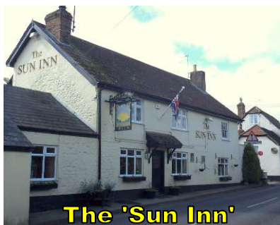
The 'Sun Inn'

Lydiard House having been the home of the St. John family, who were at their height of influence during Tudor times. The house and 300 acres of Lydiard Park are now administered by Swindon Borough Council, and are surrounded by a labyrinth of new housing and grid-pattern road system reminiscent of Milton Keynes. As would be expected the church in the park is richly endowed.