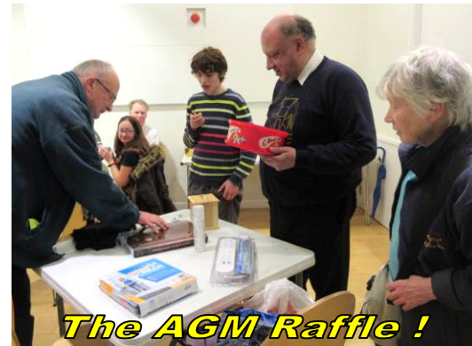
The AGM Raffle !

Thank you to all of you who attended the AGM at Wolvercote, and a special thank you to Wolvercote for hosting. The dumb bell proved a real draw, and the tea laid on by the Wolvercote ringers was excellent. I thought it would be useful to highlight some of the key points from the meeting for those towers who weren't represented: