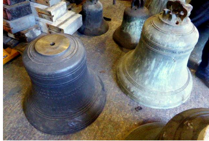
The photos show the new and the old treble, and one of the inscriptions on the new treble.